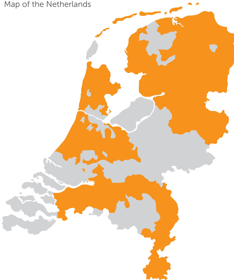
Map of the Netherlands