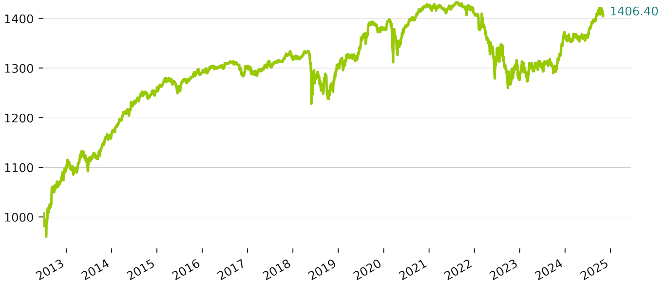
EN MTS ITA 3-5 GR