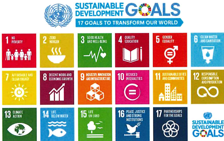
The Sustainable Development Goals