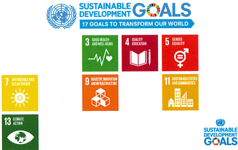
This framework mainly targets the following SDG's