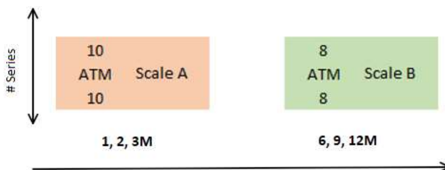
OBX Index Options – Series Introduction Policy: Scale