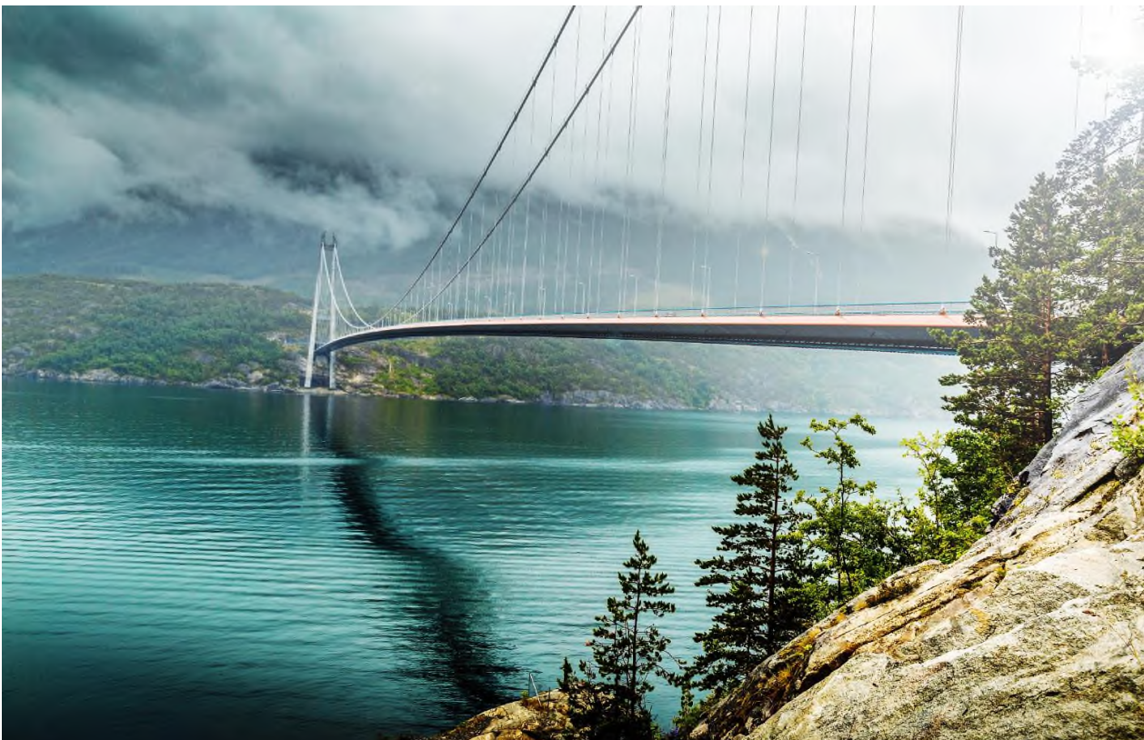
Hardanger Bridge in the County of Hordaland which in addition to car lanes also provides pedestrian pathways and bicycle lanes.

The regional train service, Jærbanen, is an important part of the public transport offering in the region and investments are now also being made in a main bus road connecting relevant parts of the region. Approximately 58% of the population in Nord-Jæren lives along the planned bus route, and given increasing housing developments in the area, the number is expected to increase further. Investments in bicycle and pedestrian roads will also be prioritized along the bus route.