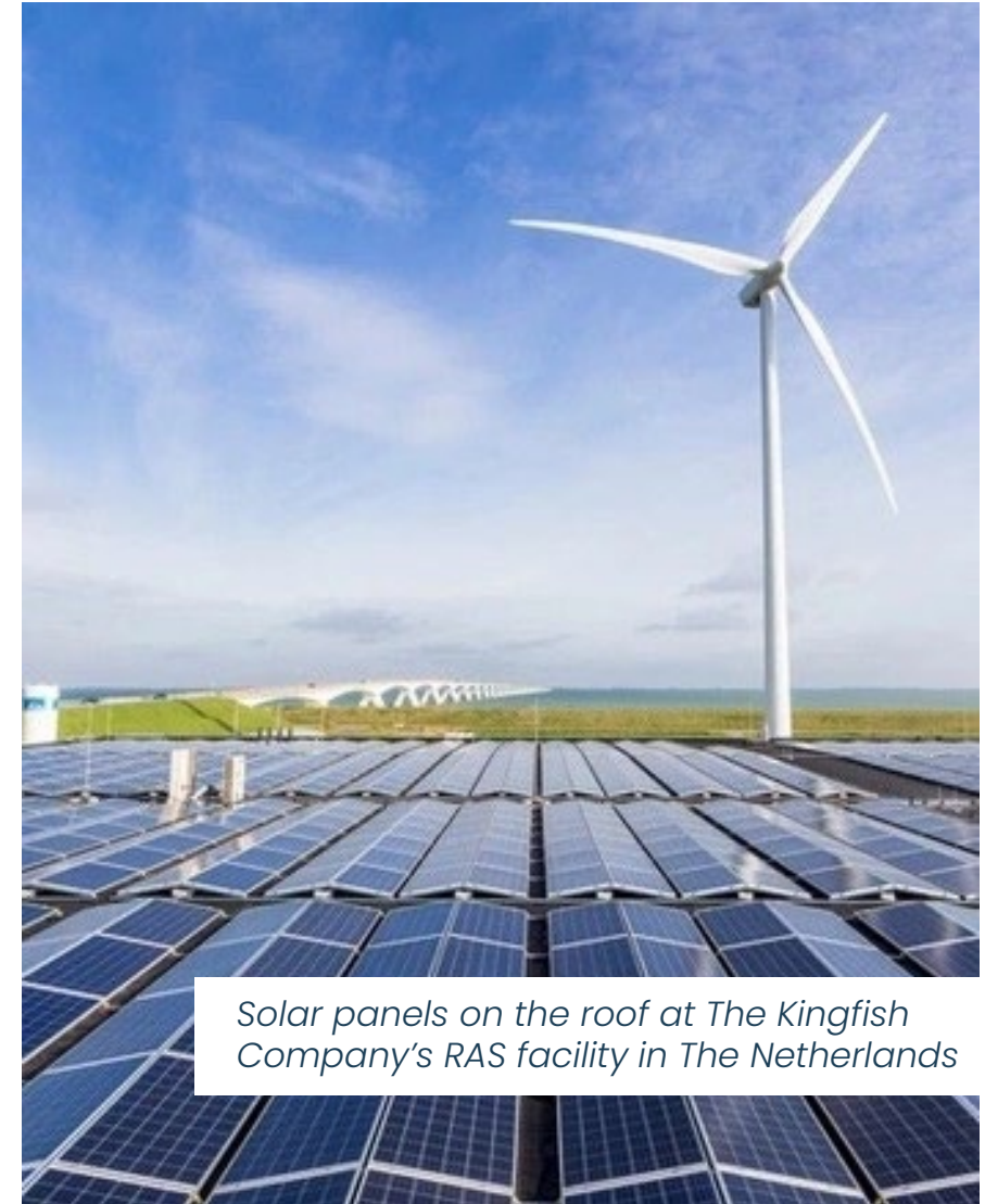
Solar panels on the roof at The Kingfish Company's RAS facility in The Netherlands