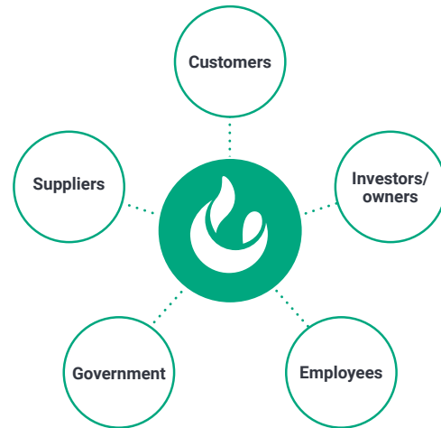
Figure 2: Hofseth BioCare's stakeholder groups

The prioritisation of Hofseth BioCare's stakeholders as well as the stakeholder dialogue was undertaken by an interdisciplinary working group consisting of Hofseth BioCare's employees representing Finance, Operations and Quality Management together with Corporate Communications.