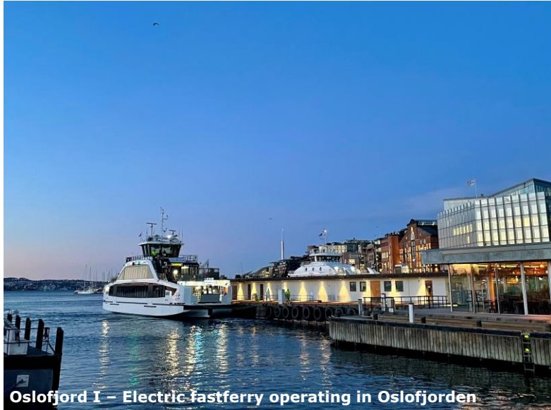
Oslofjord I – Electric fastferry operating in Oslofjorden