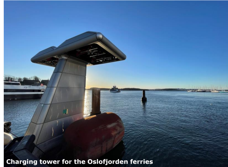
Charging tower for the Oslofjord ferries