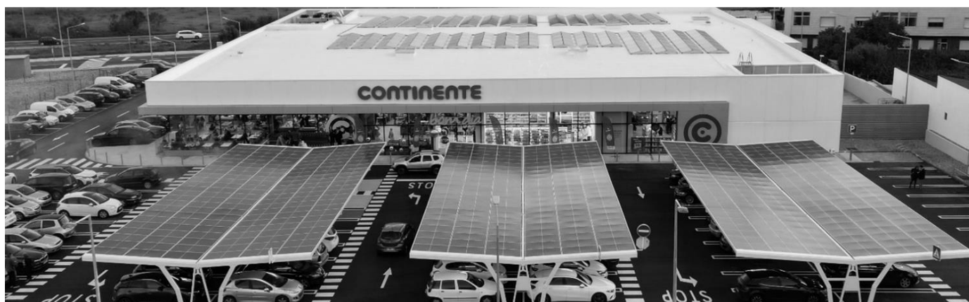
MC kept investing in own renewable energy generation capacity

As we leap into 2023, despite the risks and uncertainties on the horizon, we are confident that we will continue successfully balancing short-term agility with long-term growth ambition. We remain committed in delivering outstanding value proposals to our customers, while bolstering innovation and transformation to create sustainable growth for all our stakeholders.”