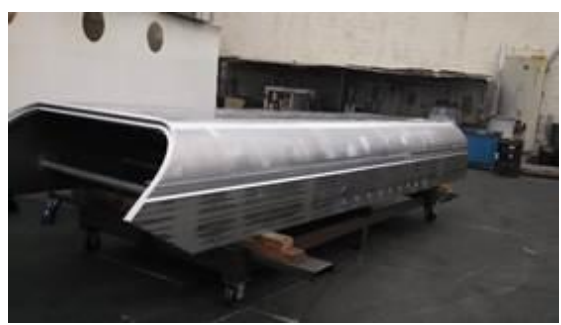
Finished formed and machined hull

Delphine Dahan-Kocher – AMERICA Corporate Communications Phone: +1 (212) 858-9963 / delphine.dahan-kocher@constellium.com